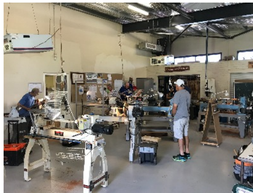
Wandi meeting room w/ Lathes

A few big differences: the Wandi group meets in a community center, has their own room (about half the size of our meeting room) and their own lathes (about a dozen of different sizes) and they meet much more often than we do. They meet on Mondays and Wednesdays mornings for hands on sessions to work on their own projects with a mentor on site to help as needed. The entire WAWA meets monthly in the evening in a setting similar to ours. their membership is about 450 active members throughout the state. A big difference, they get state funding to help keep unemployed/retired workers engaged in life and keep them from suffering from depression.