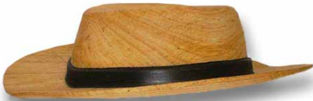
Microwaved Persimmon Hat

“Then I dry them in the microwave. The process which includes several drying sessions can take up to half a day depending on size and thickness. I leave a foot on the bowls so that I can final sand up to 600 grit when dry. I finish artistic bowls with Danish oil